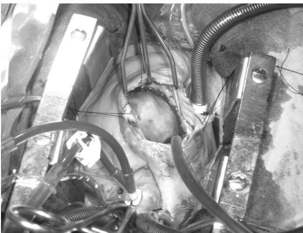
Fig. 2: Right ventricular hydatid cyst bulging into the right atrium pushing the tricuspid valve.